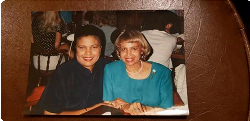
You and I at your retirement dinner