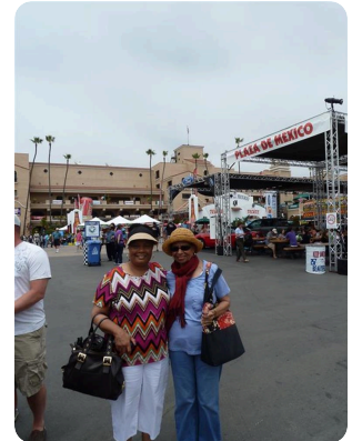
Our day at the San Diego County Fair