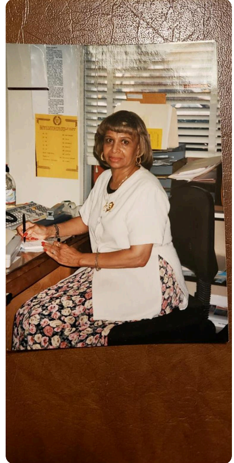
At your desk at the Montgomery counseling office