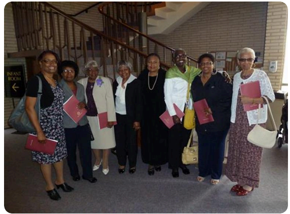
You and other friends with me at Bethel Seminary